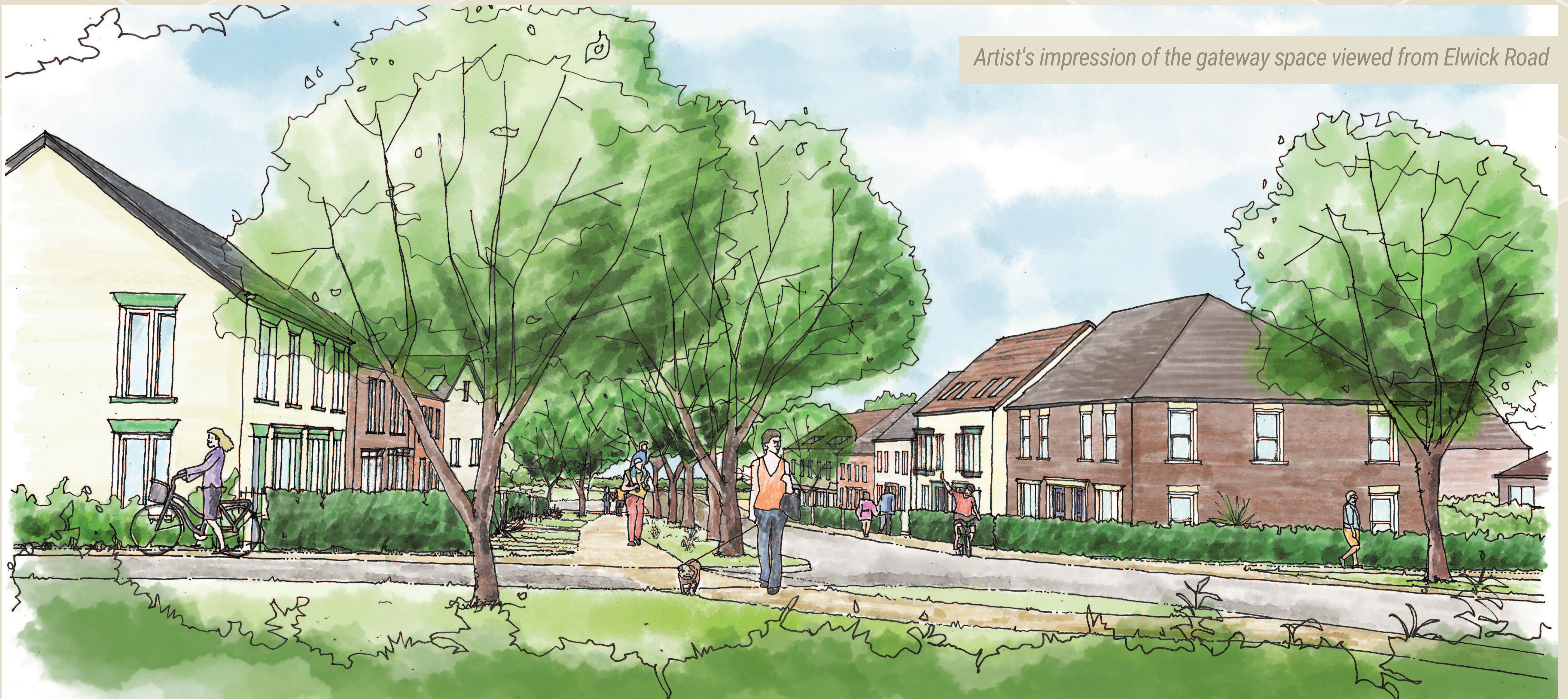
Artist's impression of the gateway space viewed from Elwick Road